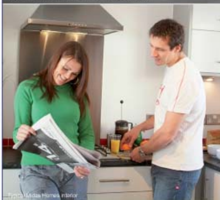
Typical Midas Homes interior