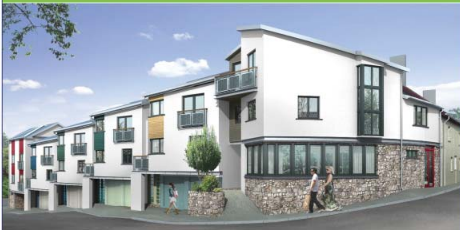
Computer generated image of the apartments at South Gate