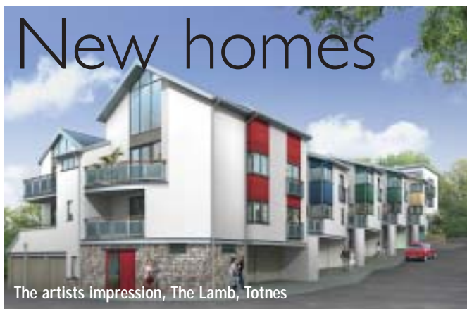
The artists impression, The Lamb, Totnes

The first homes being built at The Lamb, as part of the Totnes Southern Area development could be ready for the new owners to move into in June.