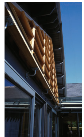
Holesworthy

It has been proposed by all stakeholders that it is important for the Community Trust to be involved in the governance of the schools.