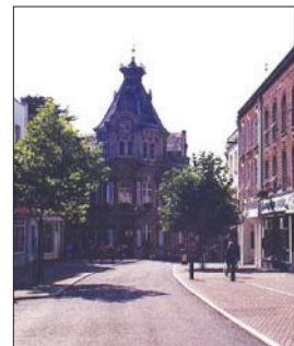
Tiverton Town Hall