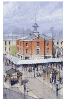
Sherford Town Hall

There is an opportunity within the Town Hall for meeting space to be made available for the Church of England, as required, in advance of a permanent meeting area being established. Land for that purpose will be made available by Red Tree and safeguarded for a reasonable period through the Section 106 Agreement. Access to housing for a church employee will be provided through wider affordable housing provision.