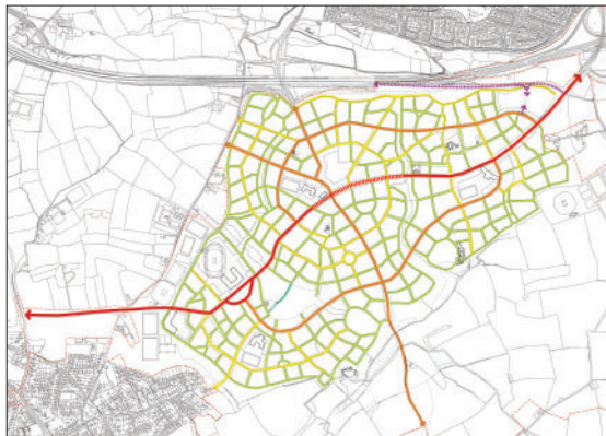
Sherford's Street Structure