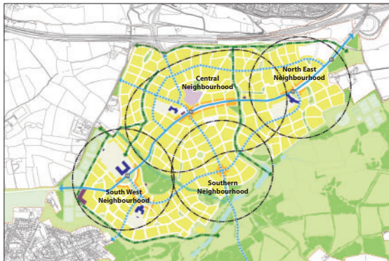
Sherford's Neighbourhood Structure

The overwhelming majority of residences in Sherford are located within a 400 m (5 minute walk) of town centre and neighbourhood facilities, parks and public transport, with the majority of commercial activities centred on a pedestrian oriented Main Street.