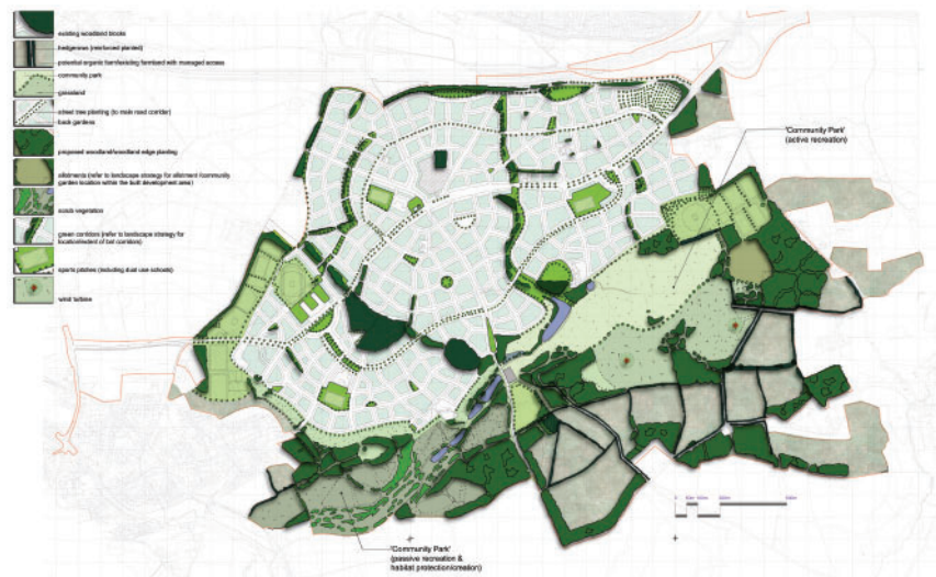
Sherford's Landscape Masterplan

The public facilities (schools and community centres) are shared to accommodate different uses at different times of the day.