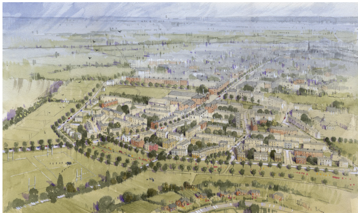
Sherford: from the South West. Illustrator: Chris Draper