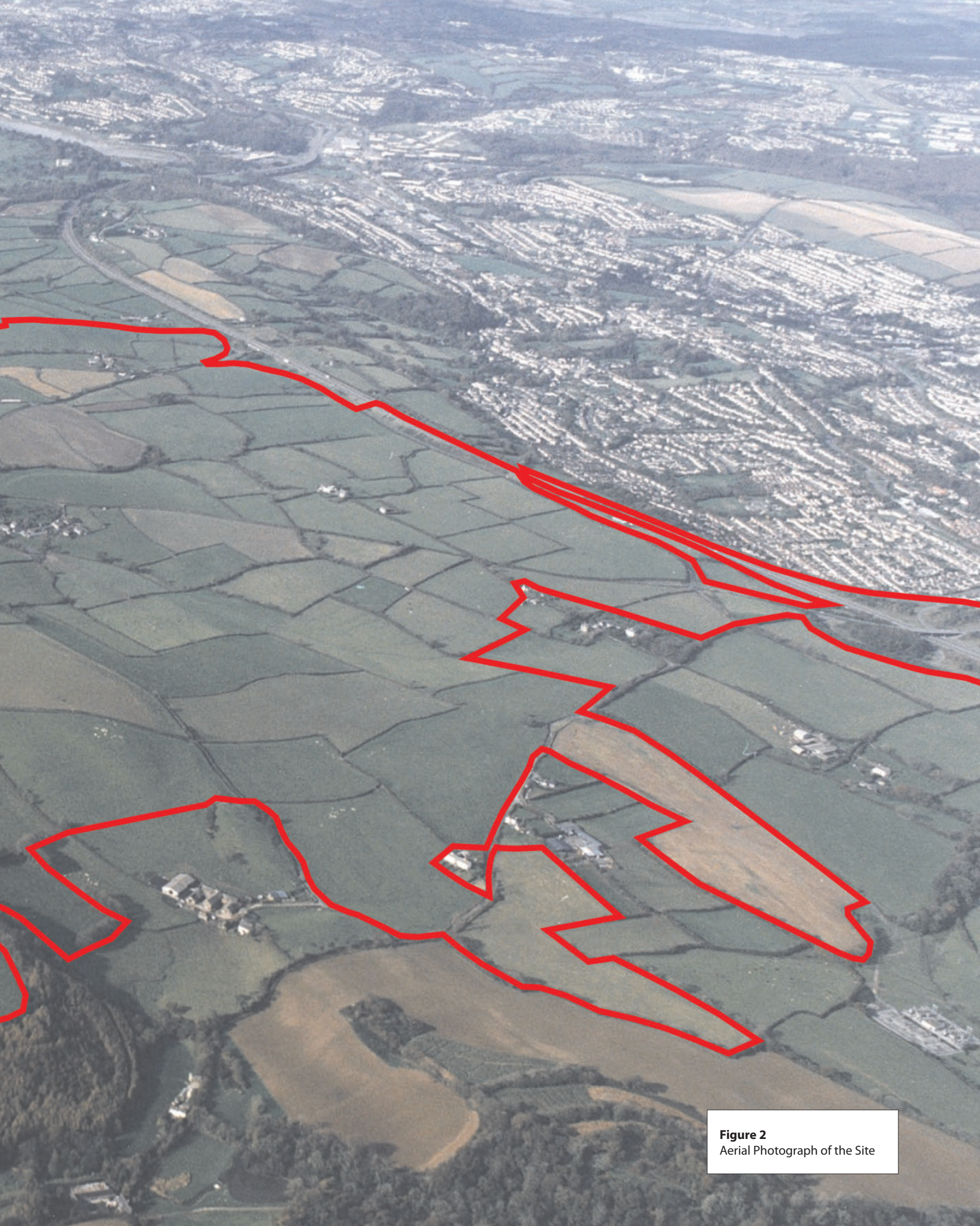
Figure 2 Aerial Photograph of the Site