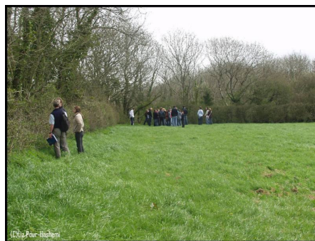
Figure 2: Workshops