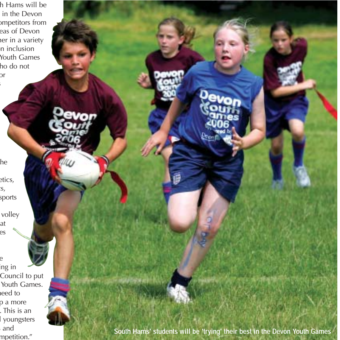
South Hams' students will be 'trying' their best in the Devon Youth Games