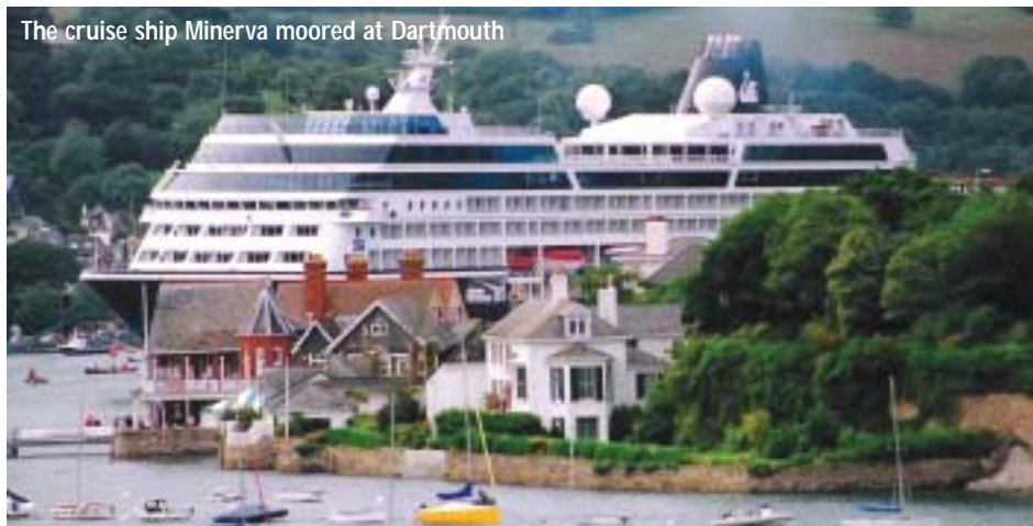
The cruise ship Minerva moored at Dartmouth